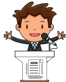
Presenting news reports