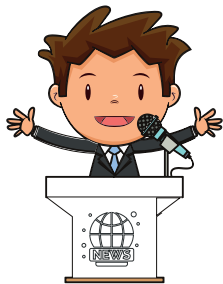
Presenting national news