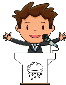
Presenting weather forecasts