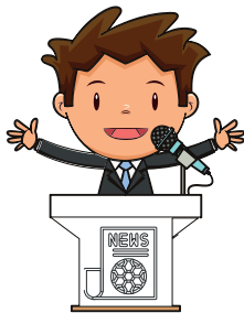
Presenting sports news